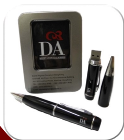
Dante Alighieri Society USB PEN

Thank you for your continuous support, Dante Alighieri Society – Hong Kong