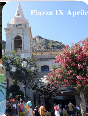
Piazza IX Aprile