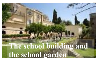
The school building and the school garden

From June 2013, our Dante Alighieri society in Hong Kong ties up with the Italian Language and Cultural School "Babilonia" and we offer all our members and students 15% discount on Italian courses at "Babilonia". If you want to have a great experience in Sicily, please feel free to contact us!